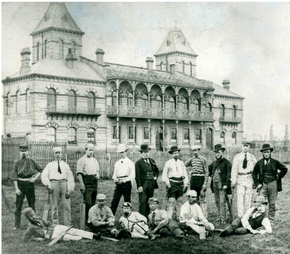
Pavilion, Victoria Park.