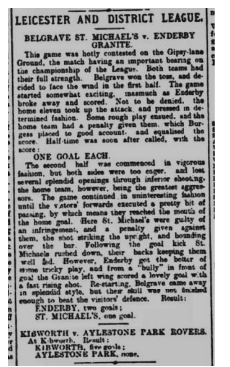
Leicester Daily Post – 4 April 1898