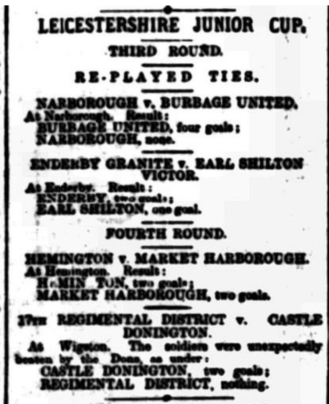
Leicester Daily Post - 6 February 1899