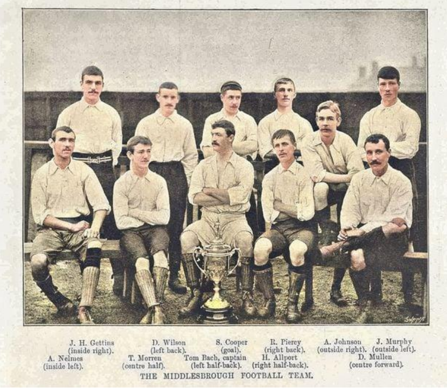
Amateur Cup winning team – 1894-95

Winner:MiddlesbroughRunner-up:Old CarthusiansNo. of entries:90