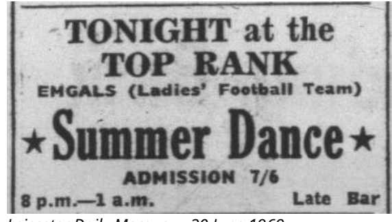
Leicester Daily Mercury - 20 June 1969