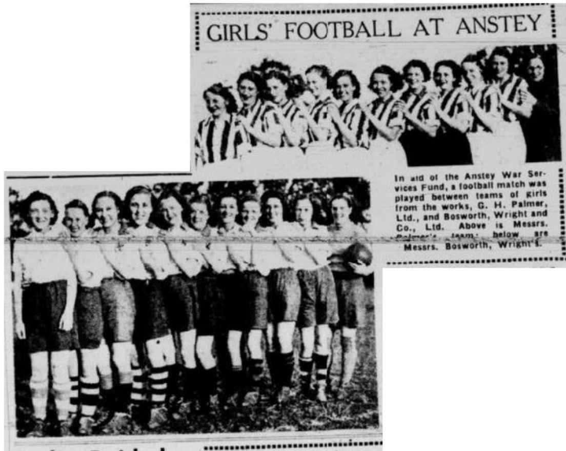
Leicester Daily Mercury - 31 August 1940