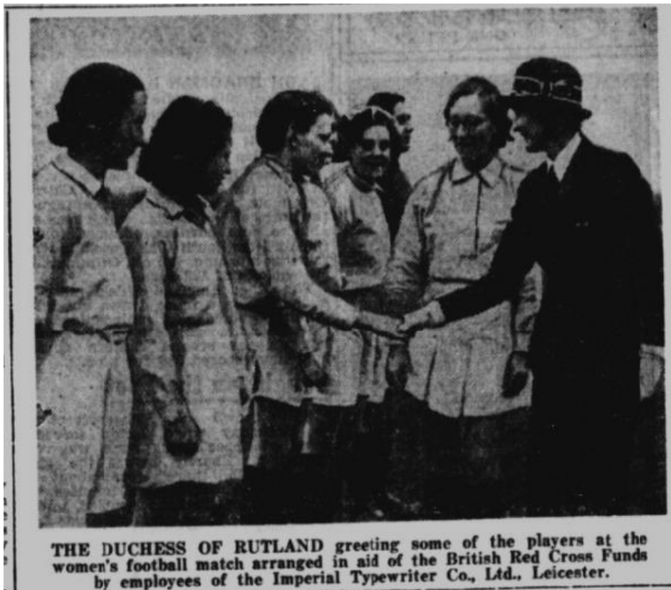
THE DUCHESS OF RUTLAND greeting some of the players at the women's football match arranged in aid of the British Red Cross Funds by employees of the Imperial Typewriter Co., Ltd., Leicester.

Leicester Evening Mail - 18 December 1939