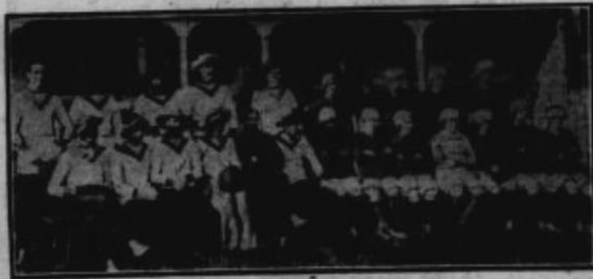
THE TEAMS IN THE COMIC FOOTBALL MATCH.

In aid of the Town Fund for sending Christmas presents to Market Harborough soldiers and sailors a comic football match and a fancy dress dance took place on Saturday last, arranged by the social committee of Messrs. R. and W. H. Symington's factory, in conjunction with the Town Committee.