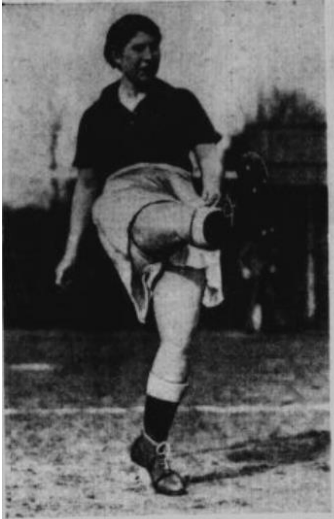
"SOCCER AMAZON."—A member of the Bozeat (Northants) women's football team that played in a charity match at Loughborough during the recent holidays.